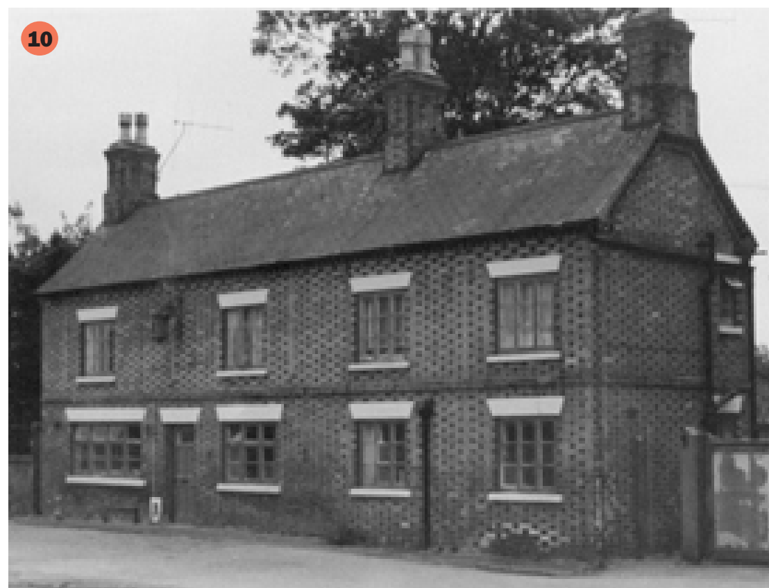
Old Red Lion

on the left is the oldest building in the village, said to date from 1637. We then come to The Old Red Lion, landlord Edward Bradshaw, with its adjoining paddock. Across from the Red Lion are five cottages, their front doors opening onto the roadside, and beside them an entry that runs to five or six terraced cottages behind (Thraves Yard). Also along this side are some malt rooms and then George Wheatley's wheelwright and joinery workshop. After the pub there is one further cottage and then open fields as far as Holme House on the old main turnpike road to Nottingham.