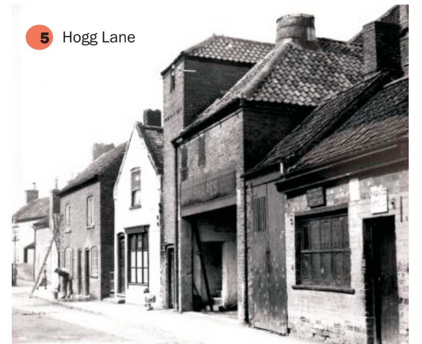
5 Hogg Lane